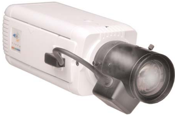
VPCMH camera side