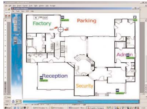
Simple to use drag and drop icons for cameras & Triplex™ DVR's