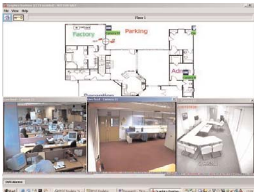
Stream live video from multiple Triplex™ units - Virtual matrix capability